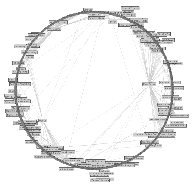
(b) Paper nodes are fixed as anchors.